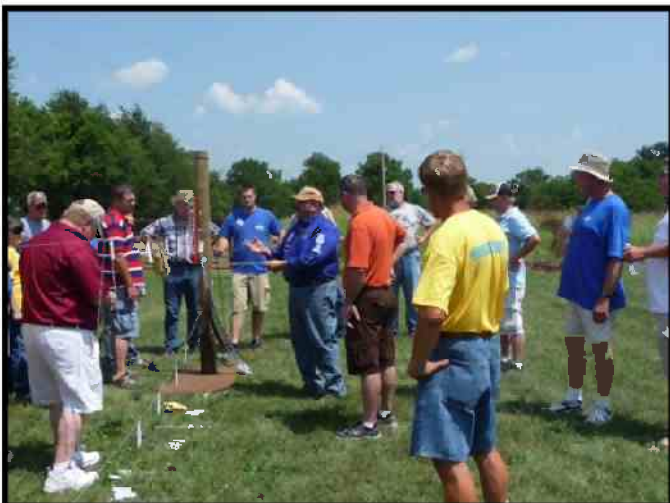
A High Tensile Fence demonstration was part of the tour at the McDowell Farm in Harrison Co.