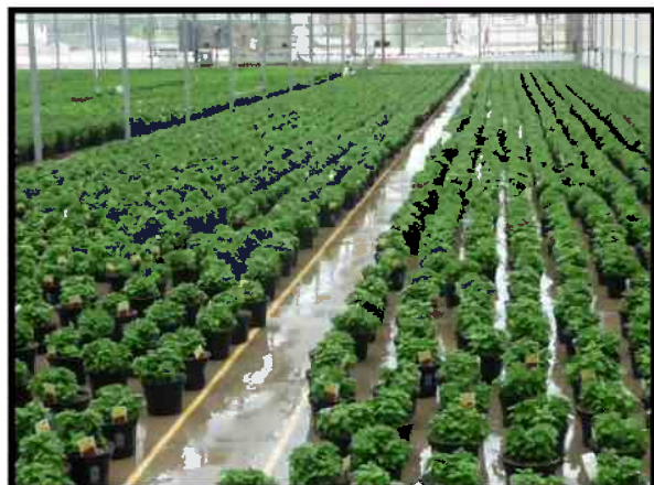
Some of the plants produced at Color Point Green House in Bourbon Co.