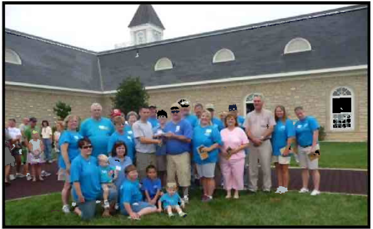
Host Chapter members from Harrison County present appreciation plaque to manager at Adena Springs Farm.

As the closing lunch came to an end, we were glad to see the rain come, but sad to see our farm family leave. We hope everyone had a wonderful time touring our area of the state and look forward to seeing everyone again.