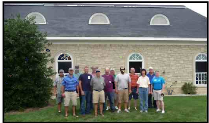
The Advisors at summer tour gather for a picture at the Adena Springs stop.