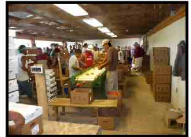
Young Farmers observe the tomato production and shipping operation at the Butch Case Farm in Harrison Co.